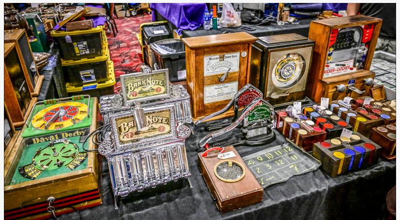
Hundreds of vintage gaming devices are on display at the CCA show.

dinnerware, swizzle sticks, casino photos, post cards, signs, table felt – just about anything a casino could put its name on. Over 50 worldwide dealers will be on hand to offer attendees the unique opportunity to examine, buy, sell, or trade casino collectibles.