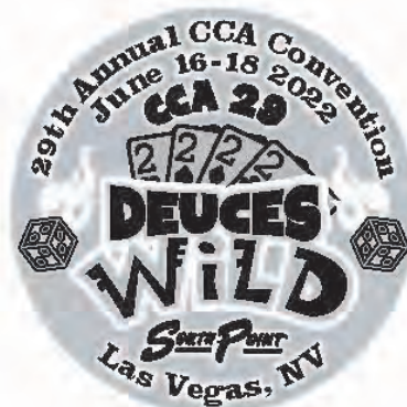
Convention Medal Artwork