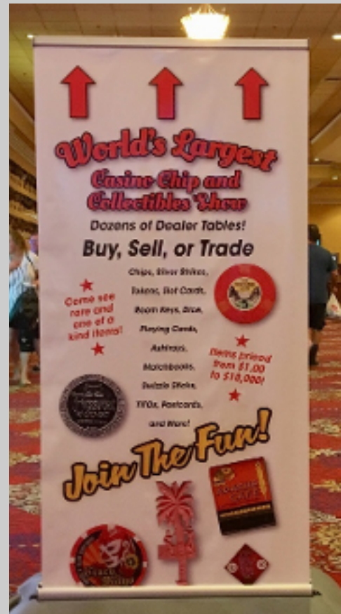
Hallway Banner