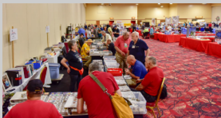
Convention Floor (J. Whobrey)