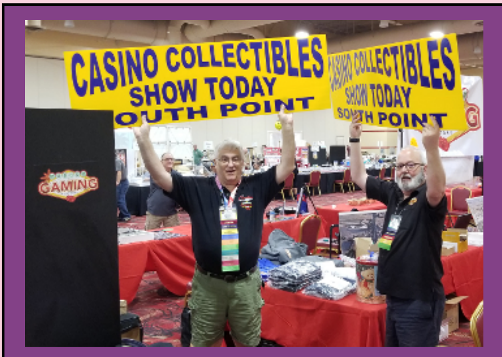
CCA Indoor Sign Twirlers