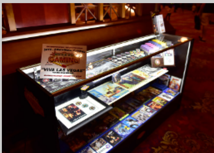
VIVA Las Vegas Exhibit (E. Sugai)