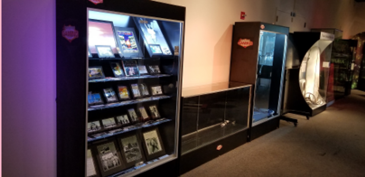
National Atomic Testing Museum - Milestone Marker #7 on The Trail of The MoGH

The MoGH has issued a Call for Materials, as we are looking for content to fill the other 2 display cases. If you have items relating to what we collect and "atomic energy" in general, then please feel free to contact Jim Follis at GamingOre@TheMoGH.org or by phone/text at 520.971.7909.