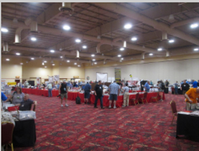
Convention Floor (by C. Mades)