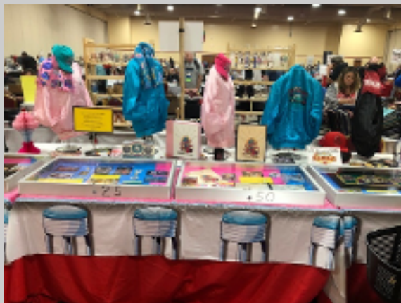
Exhibit - Eddie's Fabulous 50's (E. Sugai)