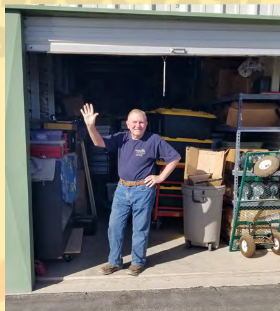
Waving goodbye from the CCA storage unit.